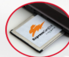
Express Card Slot